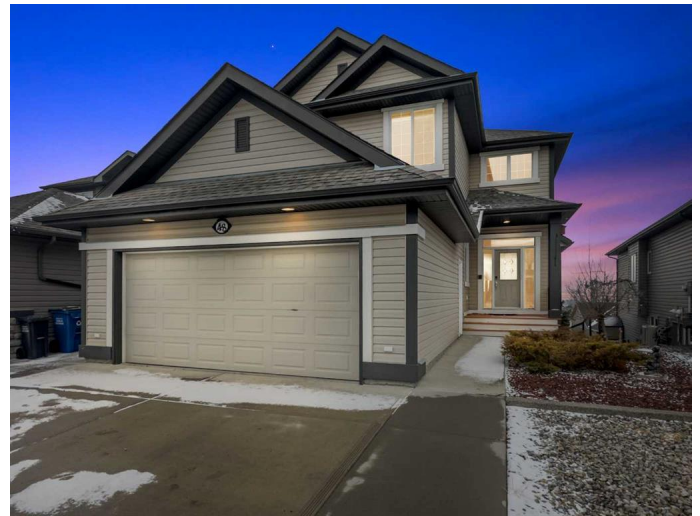
48 Sunset Cl, Cochrane, AB

Step inside to find a sun-filled interior, with large windows framing the breathtaking mountain vistas. Hardwood floors lead you from the welcoming foyer into the expansive living space, where the kitchen, dining, and living room flow seamlessly together. The gourmet kitchen features beautiful cabinetry, a large wrap around eat-up island that easily sits 8, granite countertops, stainless steel appliances, ample pantry space—perfect for both cooking and entertaining. Off the large kitchen dining, an patio space ideal for hosting barbecues, reading a book or simply enjoying the stunning mountain views, sunsets and nature at large. The cozy living room includes a gas fireplace, setting the tone for a warm and inviting space to relax during our cold winter months and Central A/C for our hot summer months.